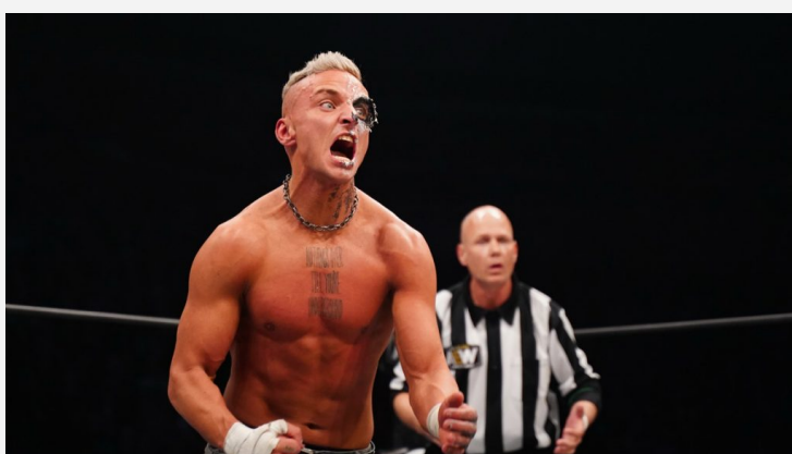
Darby Allin is all fired up.

Allin hasn't forgotten about the TNT Championship either. Winning that belt would silence all of the people who have ever doubted him, in and outside of the squared circle.