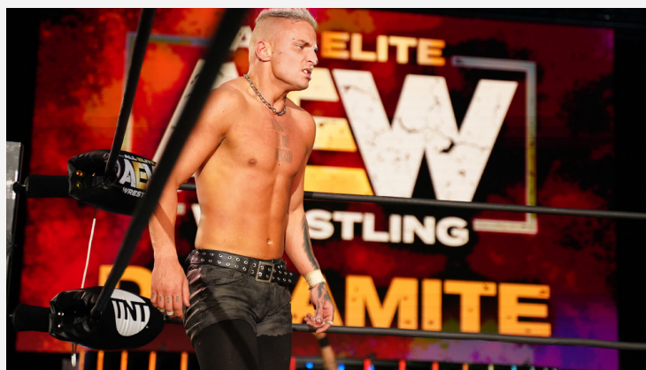
Darby Allin on Dynamite.

come to them. I have never been that way. Once you give me the ball you are never going to get it back, period. That is how I feel with these promos. I am able to create my own art and air it on national television. You best believe that I am going to take full advantage of that," he said.