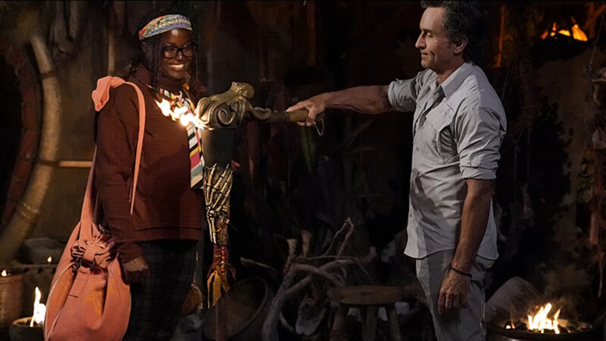
Nneka Ejere and Jeff Probst.