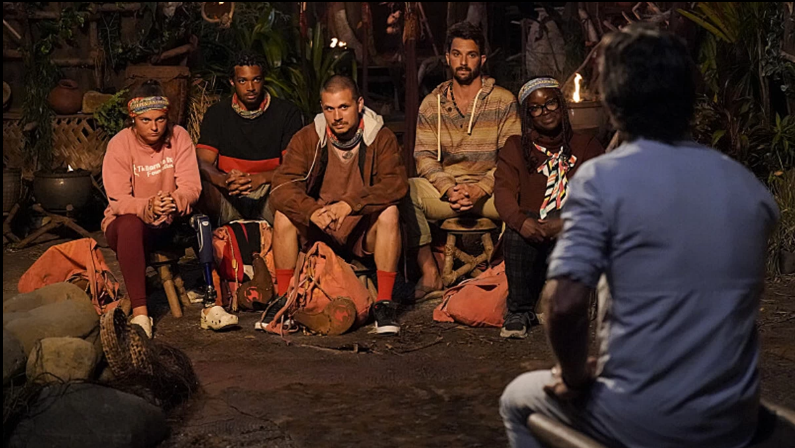
Last night's tribal council vote.

"My youngest, she's 16-years-old. She started watching Survivor and made us watch it too. She's like...I get to live vicariously through you. When you have kids or teenagers and they think you're cool, you're legit! (laughs) They have been very supportive too. They were just cheering me on," she said.